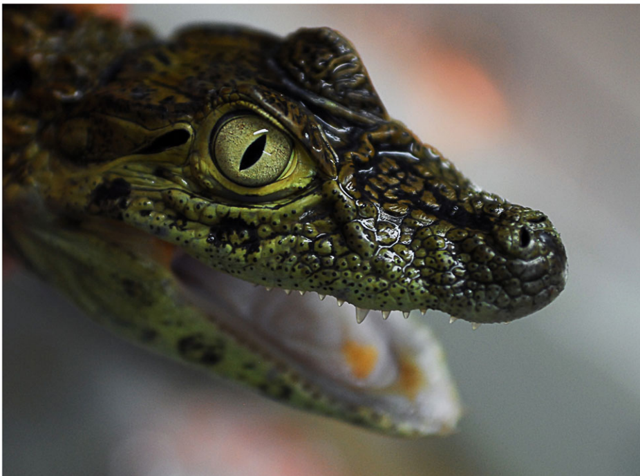
Fig. 1. Juvenile broad-snouted caiman ( Caiman latirostris ) studied in captivity at the Alligator Bay Zoological Park (Mont-Saint-Michel, France). The most notable physical characteristic is its broad snout adapted to rip through the dense vegetation while foraging for food.

where t is the time in days, \alpha is % turnover (e.g. half-lives \alpha=50 ), and c is the turnover rate of the tissue. For muscle, isotope incorporation was quantified using the values at T_0 , T_{97} , and T_{189} .